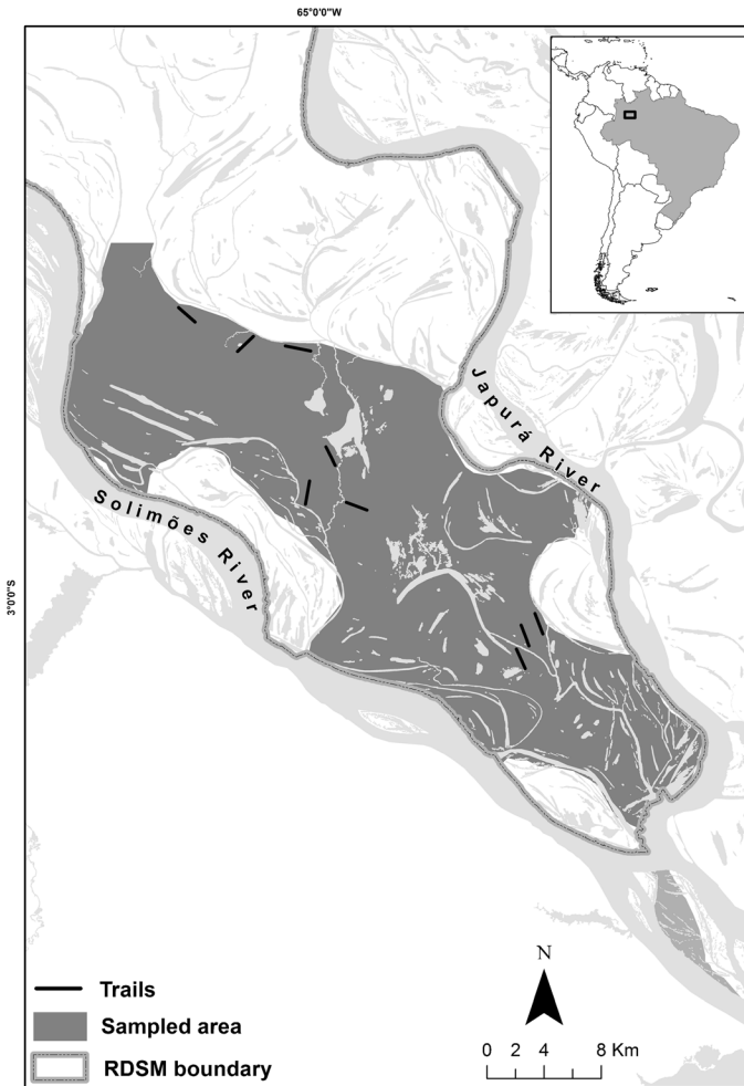
Fig. 1 Map of the geographic distribution of Saimiri vanzolinii (dark gray), showing Reserva de Desenvolvimento Sustentável Mamirauá boundaries and the locations of the nine sampling trails.

sample when they were completely submerged during high-water months and effectively not available. The percentage of submerged trees during the high-water period ranged from 3.9% ( N = 89 trees in May, 2014) to 13.3% ( N = 305 trees in June, 2013).